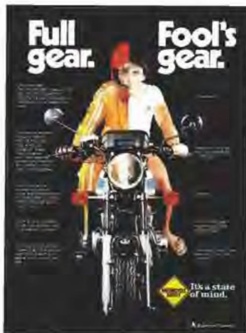
This poster is from the 1980's. As relevant today, as it always was.